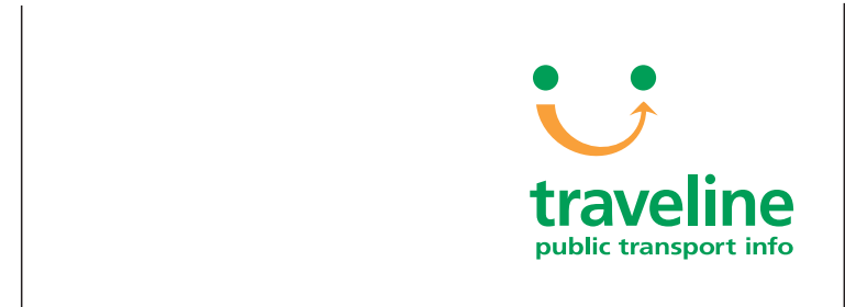
lower section of front cover