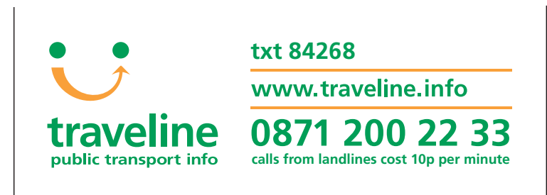
lower section of back cover